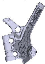
A - (1 pcs.)