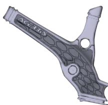
B - (1 pcs.)