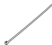
C - (6 pcs.)